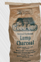
The Good-One® Natural Hardwood Lump Charcoal 20 Pound Bag