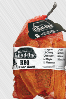
The Good-One® BBQ Wood Avg. 12 Pound Bag Many Flavors Available!